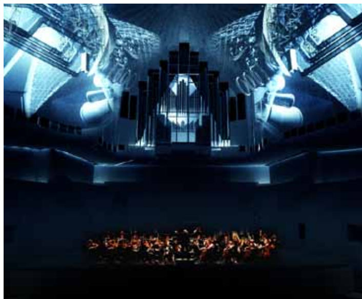
YouTube Symphony Orchestra 2011 - Sydney, Australia