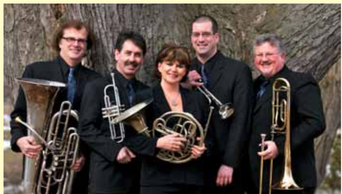
True North Brass