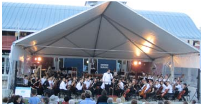
Kelowna Arts Picnic

With ferry rides to and from Vancouver Island and long bus rides through the mountains, the western portion of the tour was definitely more relaxed. The 2010 concert tour will truly be memorable thanks to Nanaimo's appreciative audience, the beautiful Chan Centre for the Arts in Vancouver, the casual outdoor concert of Kelowna's Arts Picnic, and Alberta's grand concert halls: Calgary's Jack Singer Hall and Edmonton's beautiful Winspear Centre where the CBC recorded our final concert.